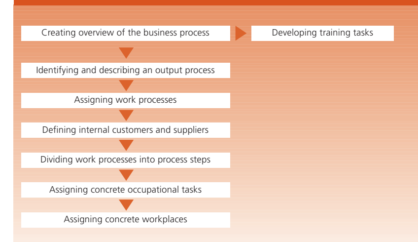
Figure 2 Planning of occupational tasks

Figure 1 Identification of suitable work process steps