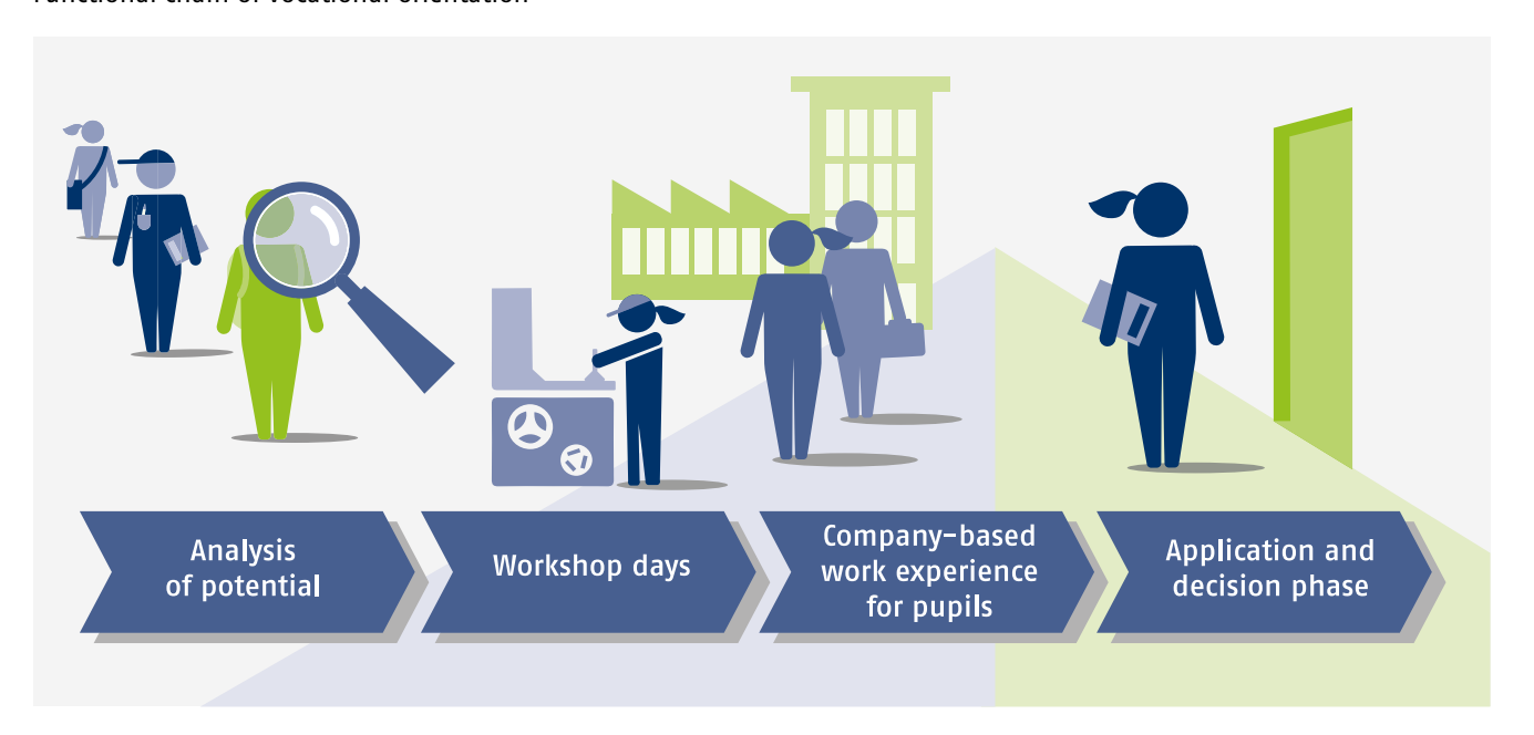
Figure 1 Functional chain of vocational orientation

vocational orientation by school pupils, by teachers and by parents and guardians. At the same time, they are structuring the activities undertaken by the pupils and the support services provided by schools and external partners.